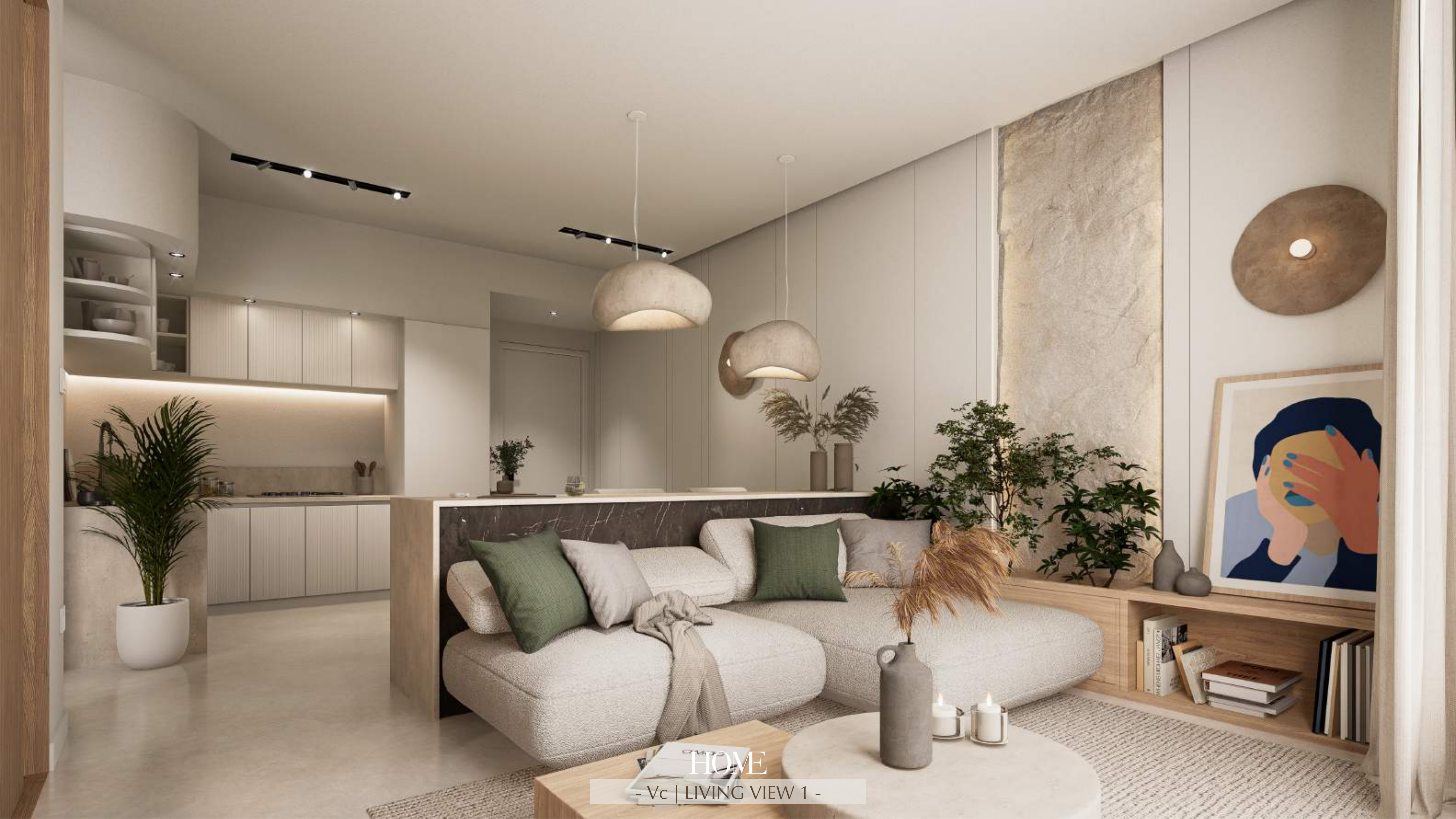
HOME - Vc | LIVING VIEW 1 -